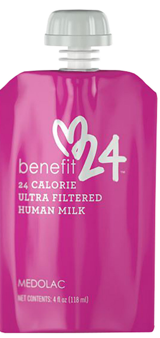
BENEFIT-24™ | 24 Cal 100% human milkbased infant nutrition